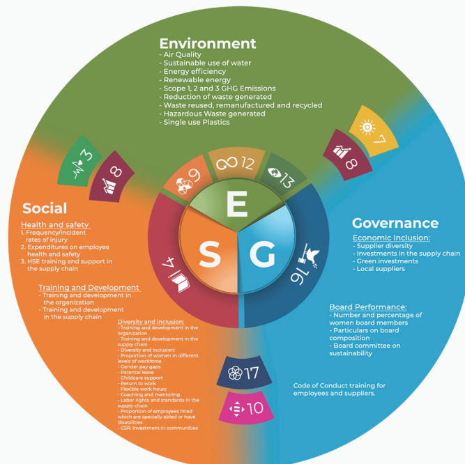
Fig 2: How the directory showcases ESG factors and the SDGs

The Pakistan Business Council (PBC) is a business policy advocacy platform, established in 2005 and now composed of around 100 of the largest private-sector businesses and conglomerates, including multinationals. Its main objectives are to create a business environment for sustainable growth of jobs, exports and self-sufficiency, especially in food products. It also works to promote formalization of the economy.